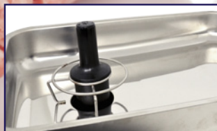
Features a large hopper with hand protection and ABS plastic pusher