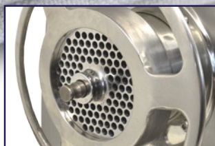
1/4" (6mm) plate included