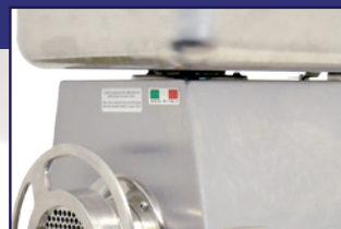
Structured in AISI 304 stainless steel