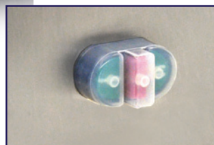
ON/OFF Switch with waterproof rubber protection