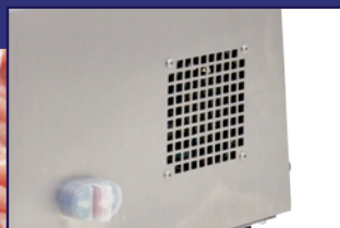
Ventilated motor with thermal protection